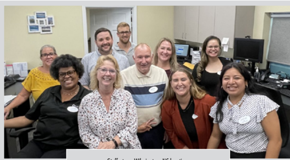
Staff at our Wilmington, NC location.