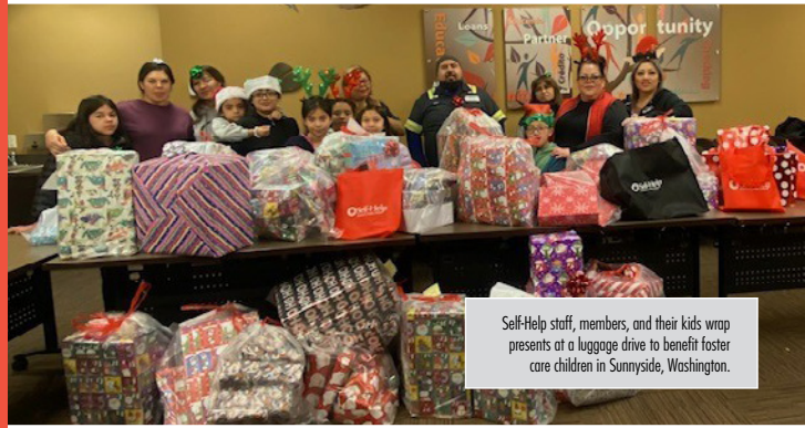
Self-Help staff, members, and their kids wrap presents at a luggage drive to benefit foster care children in Sunnyside, Washington.