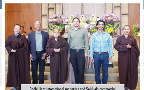
Bodhi Light International monastics and Self-Help commercial lending staff at BLI's San Francisco temple.