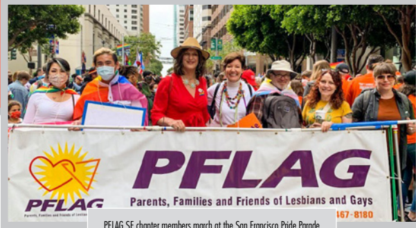
PFLAG SF chapter members march at the San Francisco Pride Parade